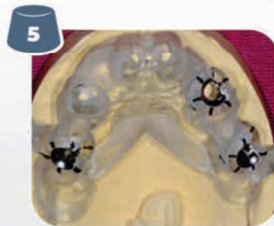
5 The drilling template is produced quickly and cost-effectively using the printing process.