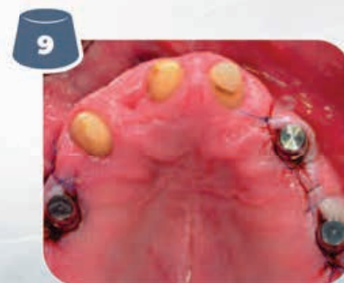
9 Once the suture is closed, the Revocone housings are attached with the white Revocone caps..