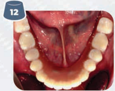
12 Correct distribution of abutments enables dorsal prosthesis removal with optimal mucosal support.