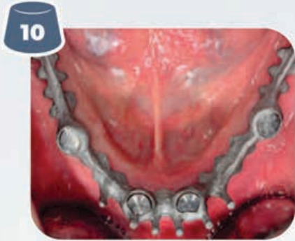
10 The tertiary structure is bonded stress-free in the mouth with DTK adhesive.