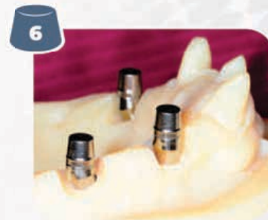
6 The correct implant positions are set using the Revocone base for the producing the temporary restoration.