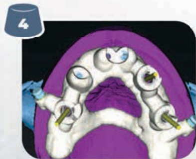
4 The drilling template for guided implantation is designed in CAD.