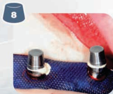
8 The Revocone cones are attached with DTK adhesive.