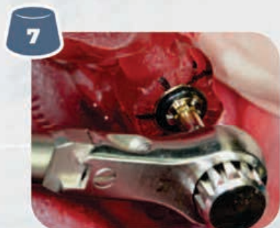
7 The implants are placed using the drilling template according to the protocol.