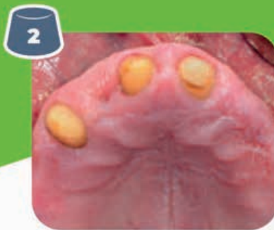
2 Three teeth are worth preserving and pre-prepared for conical crowns.