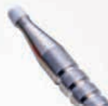
RevoCone inserter 1 piece