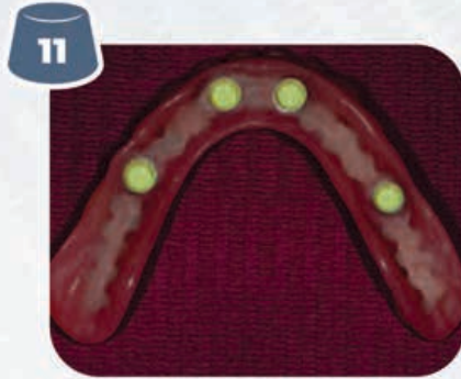
11 The yellow RevoCone caps provide a secure hold for the prosthesis as well as easy removal of the prosthesis for cleaning.